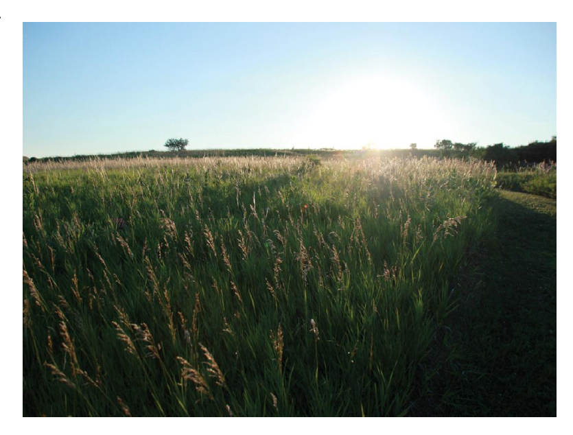
Winning picture of the 2016 photo contest take by Heather Rudynski